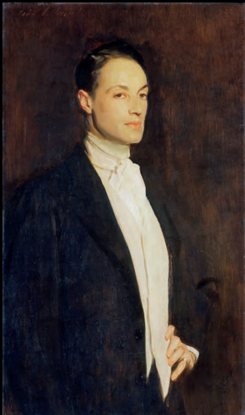
Sir Philip Sassoon, 1923, by John Singer Sargent 1856–1925

Sir Philip Sassoon (1888–1939) was a celebrated British politician, art connoisseur and society host, entertaining many notable guests of the day including King George V, Winston Churchill, Lawrence of Arabia, Charlie Chaplin, and countless others. A member of the Sassoon-Rothschild family, his sister was Sybil Sassoon, who married the Marquess of Cholmondeley and he was a cousin of the war poet Siegfried Sassoon.